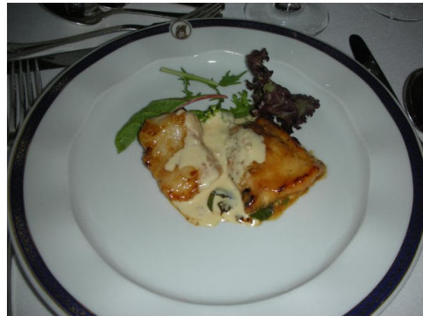
On the right - Pan-Sautéed Crocodile Filet with lime and ginger sauce

2/17-18/07 Days 33 and 34 – At Sea – Saturday and Sunday: Saturday was a kickback day with not much going on. We attended a port lecture for Cairns (pronounced Cans) Australia. Cairns is the gateway to the Great Barrier Reef which acts as a draw for the tourist industry. There is also significant agricultural activity particularly in growing and harvesting sugar cane. In the afternoon we gathered in our cabin with our dinner table mates for a little before-dinner wine and conversation. The highlights of the dinner hour were tasty Australian menu items consisting of crocodile and kangaroo dishes.