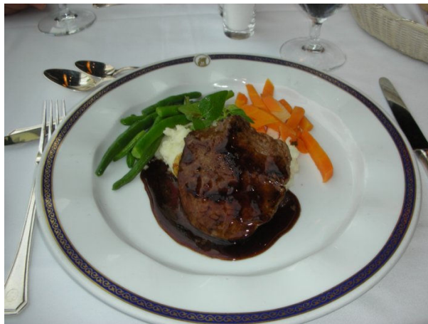
On the left - Sautéed Kangaroo Steak with Balsamic glaze – with carrot, green beans and mashed potato

These cuts of crocodile and kangaroo meat were tender and delicious. The first rate chef in the kitchen and well crafted sauces probably had a lot to do with that result.